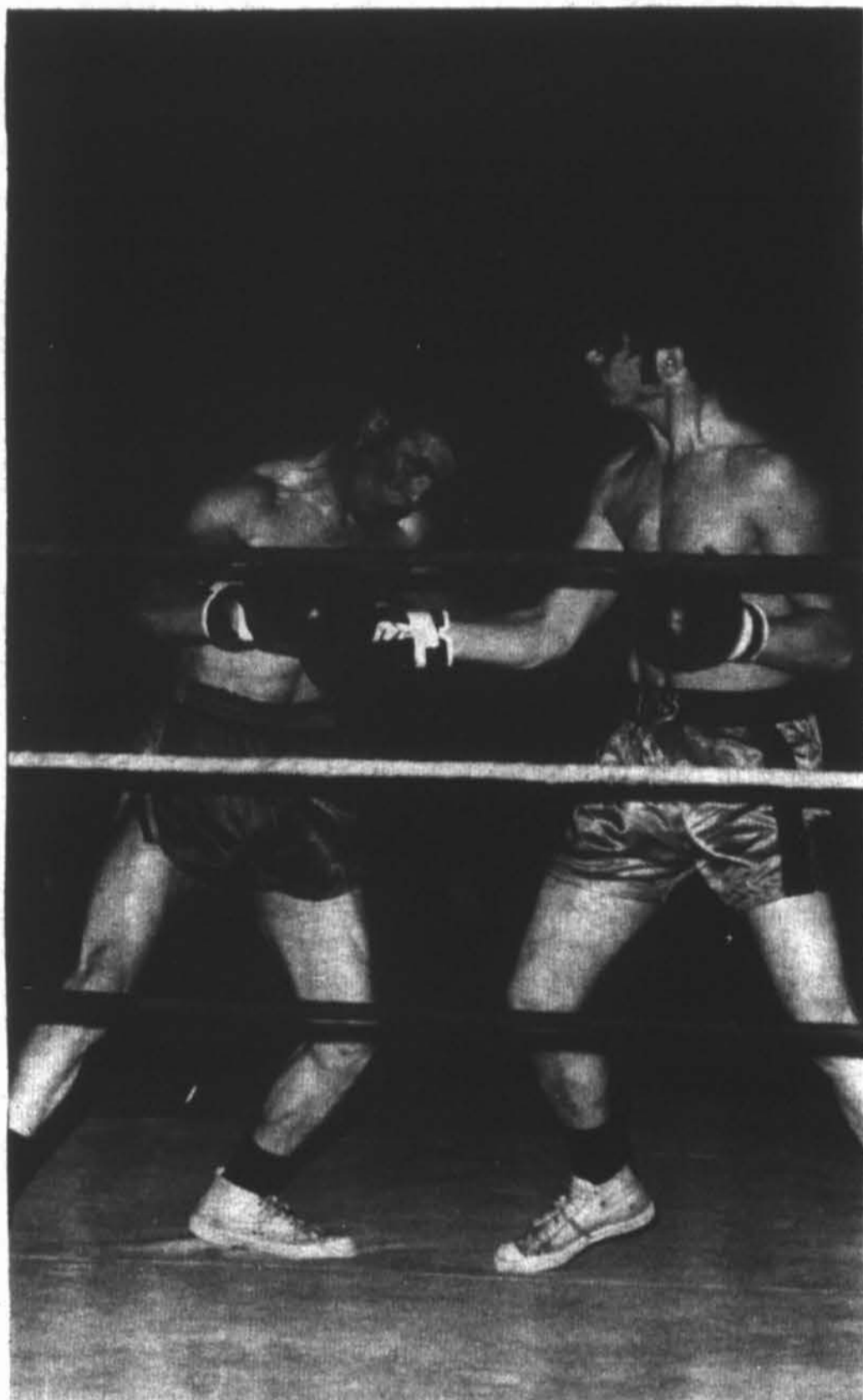
TWO COMPETITORS are snapped in action by our cameraman during a bout held here recently. More boxing action is expected at the Labrador City Arena later this month.

Nothing new to report on other sporting activities.