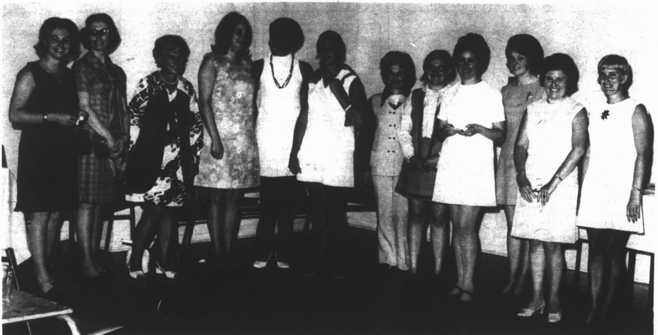
VISITORS FROM MONTREAL Y - Last Friday the twin towns of Labrador City - Wabush had the pleasure of hosting representatives from the Y in Montreal. In the above photo, a group of ladies are shown as they attended the reception held from YMCA instructors at the Wabush Recreation Centre. Below, interested sportsmen from Labrador City - Wabush are shown with guests from the Downtown Y of Montreal. This group was also photographed at the reception.