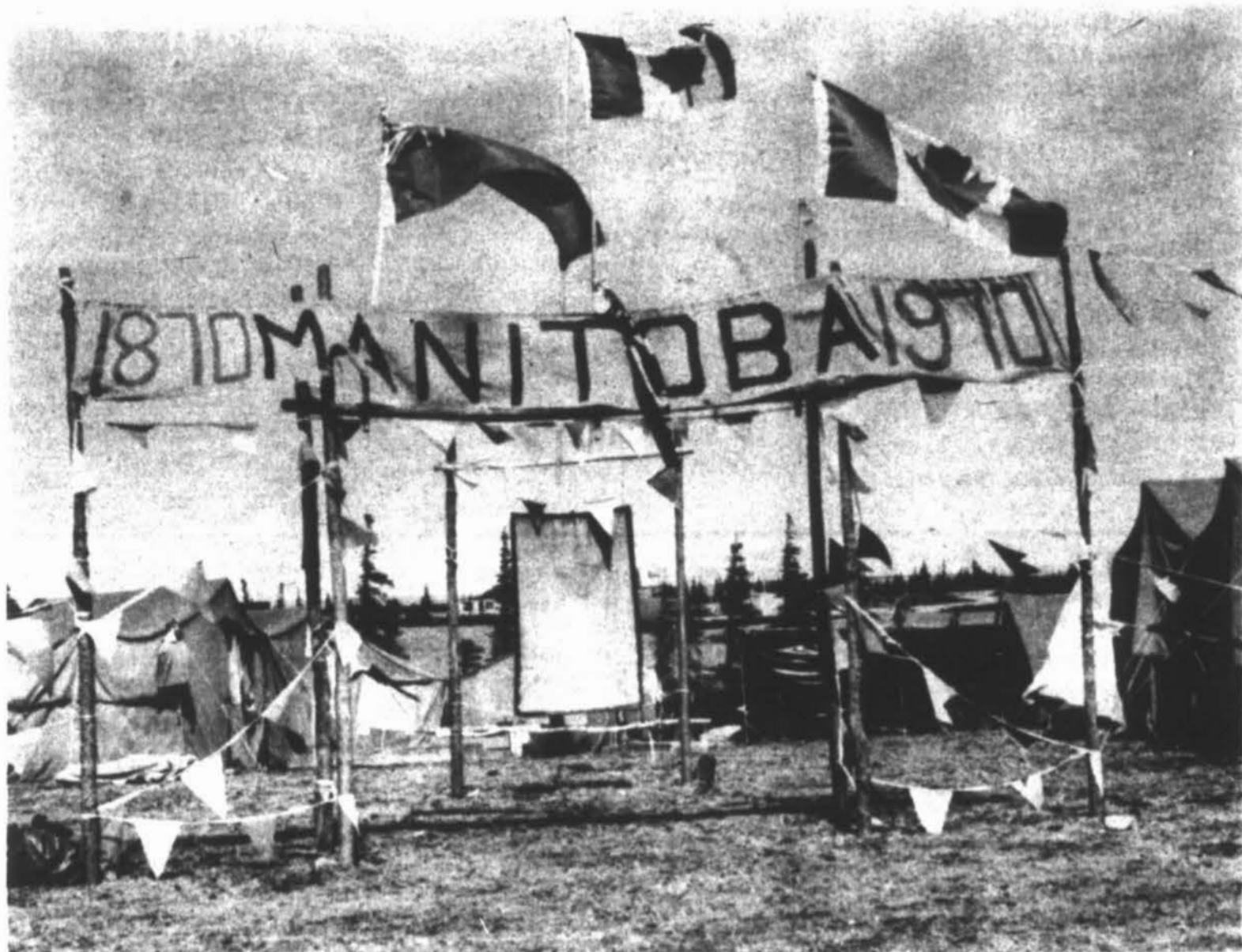
SCOUT EVENT IN MANITOBA — Above is the entrance to the Scout Camp which was held last month at Churchill, Manitoba. The archway indicates that the prairie province is celebrating its centenary this year. In the photo below, some of our local boy scouts and cubs pose during camping activities. These young people travelled from Western Labrador to attend the Manitoba camp —.

Quebec Premier Robert Bourassa said last month his Government will not use coercive measures to make French the working language of the province, but he implied it may use its purchasing policies to influence it by giving preference to firms using the French language. He said he found no hostility toward his intention to make French the working language.